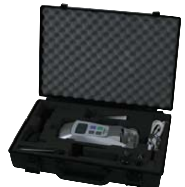
FGV-HXY with Accessories in Protective Carrying Case